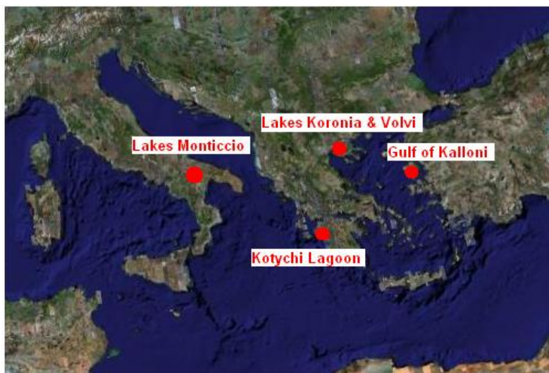
Figure 1. Test sites of the WETMUST project

The objective of this work is to describe the design, the technical and functional specifications of the monitoring network under development in the WETMUST project.